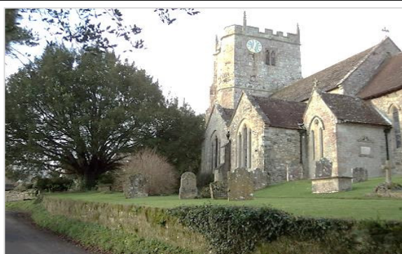
St Mary the Virgin, East Knoyle