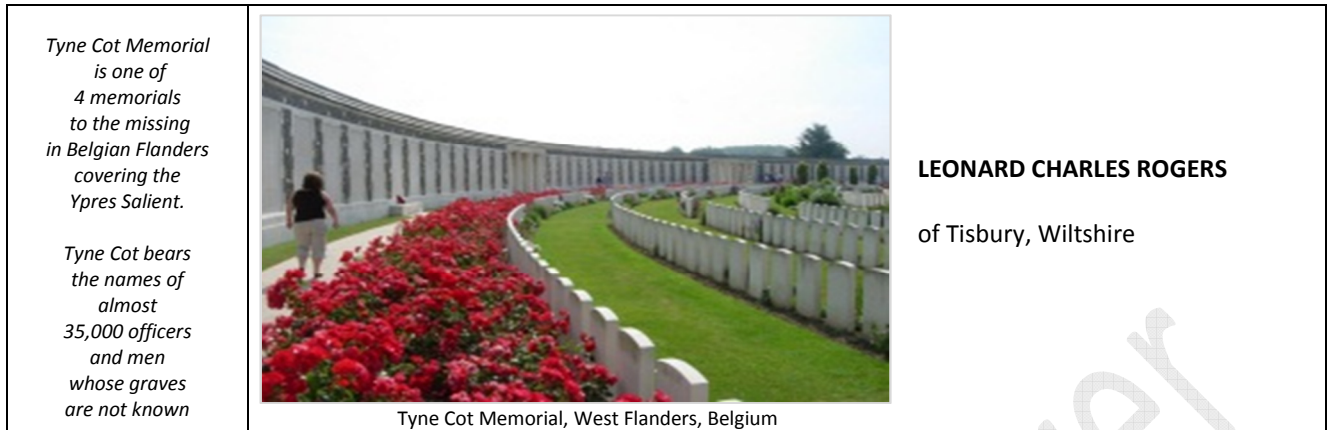
Tyne Cot Memorial, West Flanders, Belgium