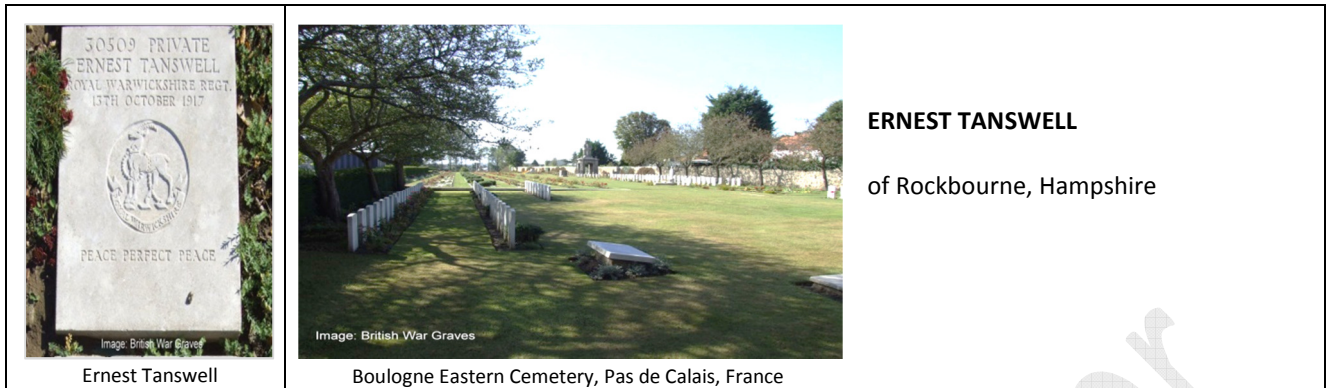
ERNEST TANSWELL of Rockbourne, Hampshire