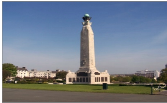
Royal Naval Memorial, Plymouth