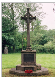
Donhead St Andrew