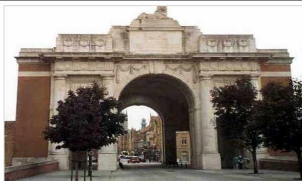
Ypres Menin Gate Memorial, Belgium